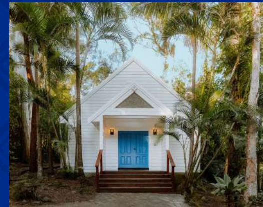
Aanuka Beach House aanukabeachhouse.com.au | Coffs Harbour