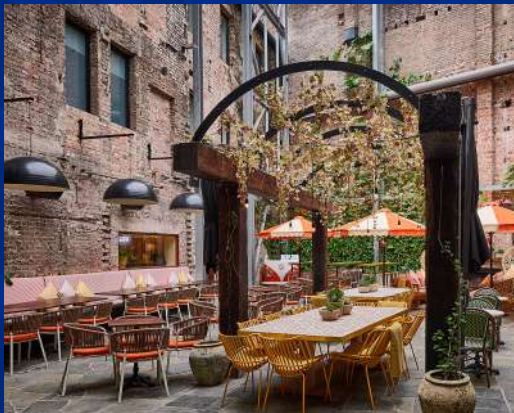
The LUCKY Hotel theluckyhotel.com.au | Newcastle