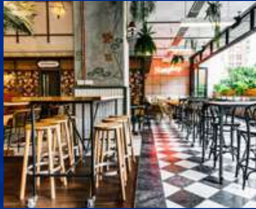
VERANDAH PRECINCT verandah.com.au | Sydney