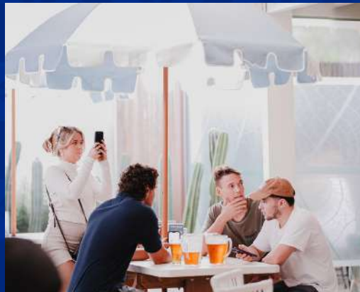
SHAFSTON HOTEL shafstonhotel.com.au | Brisbane