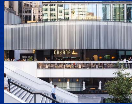
CABANA bar cabanabarsyd.com.au | Sydney